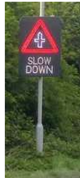
Vehicle Activated Signs (x2)